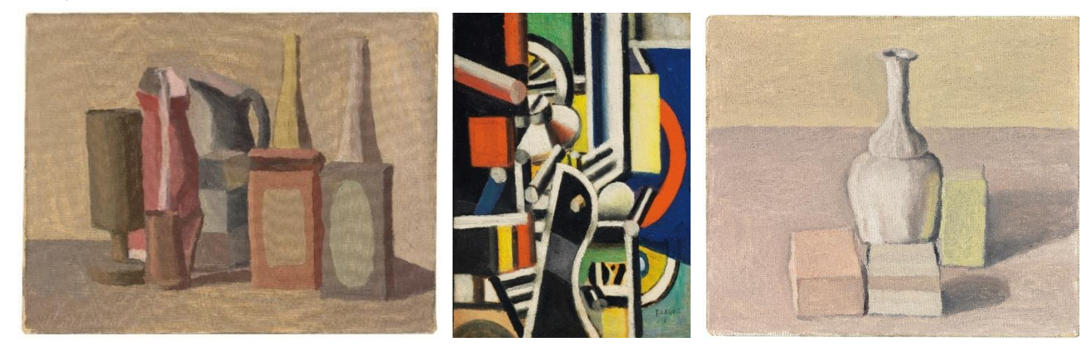
Left: Giorgio Morandi, Natura morta , oil on canvas, 1942, estimate: £600,000-900,000 Middle: Fernand Léger, L'usine (Motif pour le moteur) , oil on board, 1918, estimate: £900,000-1,200,000 Right: Giorgio Morandi, Natura morta , oil on canvas, 1957, estimate: £400,000-600,000