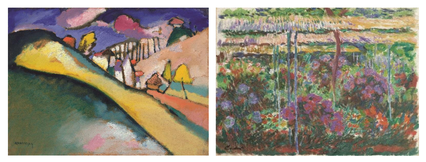
Left: Wassily Kandinsky, Studie für Landschaft (Dünaberg) , oil and gouache on board, 1910, estimate: £3,000,000-5,000,000 Right: Claude Monet, Pivoines (Peonies) , oil on canvas, 1887, estimate: £3,500,000-5,500,000

Leading highlights from the Evening Sale include André Derain's <u>Londres: la Tamise au pont de Westminster</u> (1906-07, estimate: £6,000,000-9,000,000, illustrated above); Pablo Picasso's late painting <u>Mousquetaire et nu assis</u> (1967, estimate: £12,000,000-18,000,000, illustrated above); and Wassily Kandinsky's <u>Studie für Landschaft (Dünaberg</u>) (1910, estimate: £3,000,000-5,000,000, illustrated below). Alongside these are Edgar Degas's <u>Dans les coulisses</u> ( circa 1882-1885, estimate: £8,000,000-12,000,000, illustrated above), Kees Van Dongen's La femme au collier fond rouge (1905, estimate: £5,000,000-7,000,000, illustrated above) and two masterpieces by Claude Monet: Prairie à Giverny (1885, estimate: £7,000,000-10,000,000, illustrated above) and Pivoines (Peonies) (1887, estimate: £3,500,000-5,500,000, illustrated below). '20th Century at Christie's' will be exhibited from 20 to 27 February 2018.