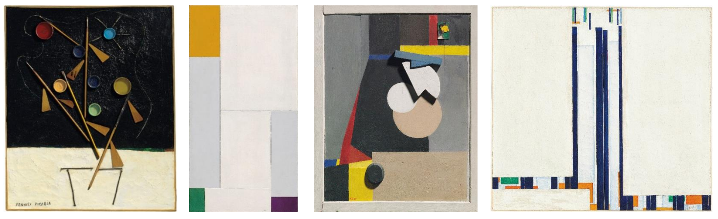
Abstraction Beyond Borders

Left: Francis Picabia, Sans titre (Pot de fleurs), Ripolin, Ripolin paint can lids, circa 1924-26, estimate: £900,000-1,200,000 Middle left: Georges Vantongerloo, Composition émanante de l'équation y=ax2+bx+18 avec accord de l'orangé-vert-violet, oil on canvas, 1930, estimate: £800,000-1,200,000